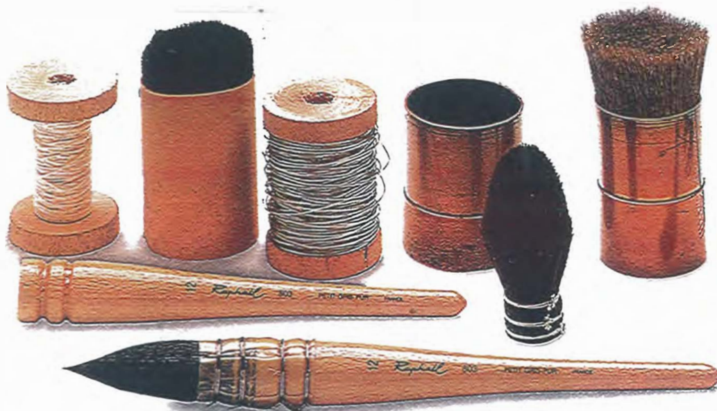
Components and materials used in brush making

This hair comes from the ear of a breed of cow and is strong and springy, but quite coarse in texture. Although it does not point well and is not suitable for making fine-pointed brushes, it is, however, a very good hair for use in square-cut brushes.