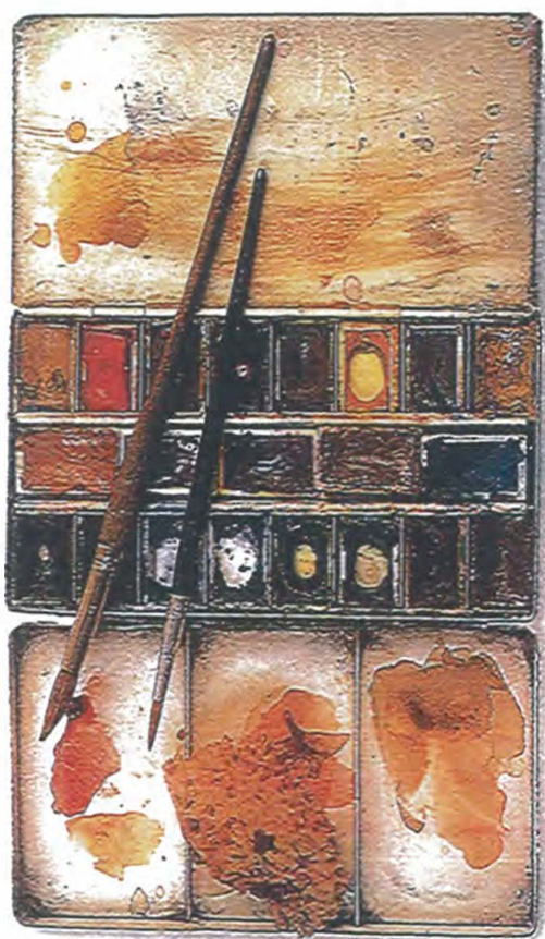
A watercolour box with small pans is light and portable, making it convenient for painting outdoors on location.