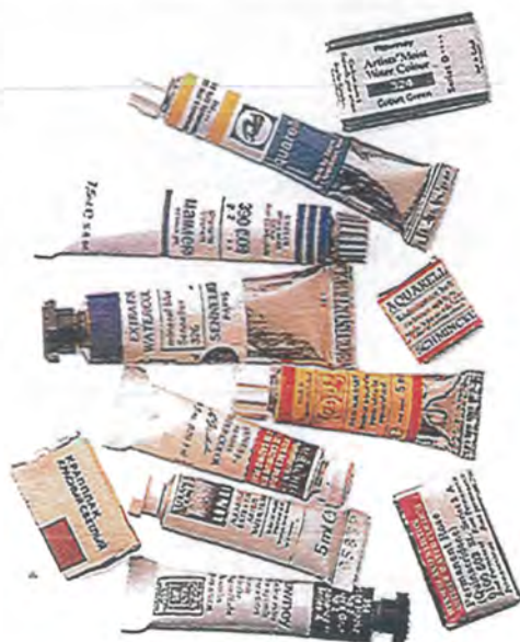
A selection of watercolours, including pans, half pans and tubes.

Watercolours are available in two main forms – as small, compressed blocks of colour, which are called 'pans' or 'half pans' according to their size, and as moist colour in tubes. The formulations of tube and pan colours are very similar, and which