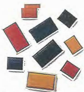
Pans and half pans