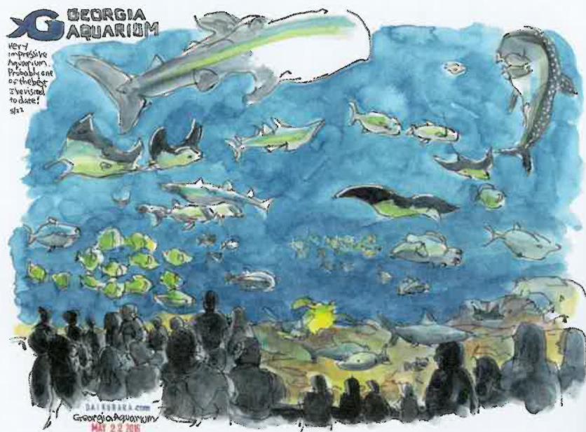
Georgia Aquarium Atlanta, GA

The goal is to try to finish everything on location, but we do not always have the time to make this happen. At the very least, finish all line drawings on location and take many pictures that you can use later for color reference. I have a built-in stand on my iPhone case to prop up the angle of the screen. This is great for getting the perfect viewing angle when finishing the sketch at a nice coffee shop!