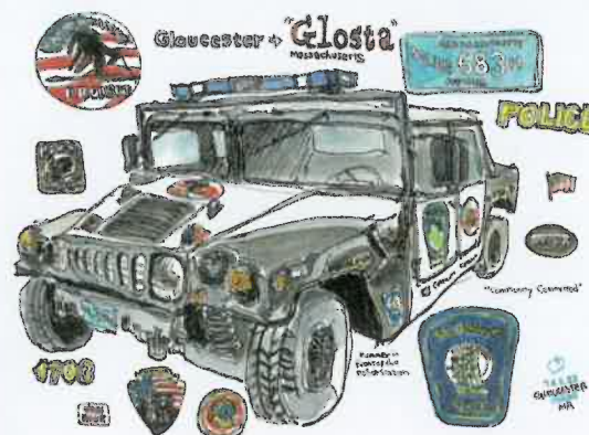
Police Hummer Gloucester, MA

I spotted a police Hummer with lots of emblems and stickers and just had to get a sketch! The graphics details and color were added immediately afterward at a Dunkin' Donuts just down the street.